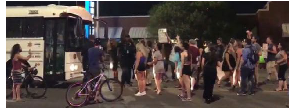
On the night of June 11, 2017, protesters led by BAMN confronted the police and ICE in downtown Detroit, clashing on the street as ICE agents attempted to drive away in a bus with dozens of captive Iraqi immigrants. The photo above shows protesters blocking the path of the bus.