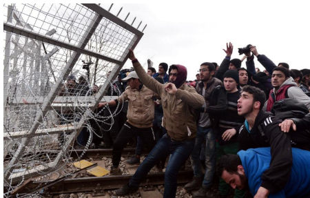
Below: Syrian refugees, penetrating the barricades to cross the Greek border.