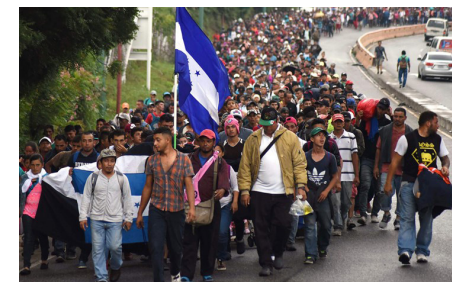
Above: a migrant caravan, marching from Central America to the U.S.