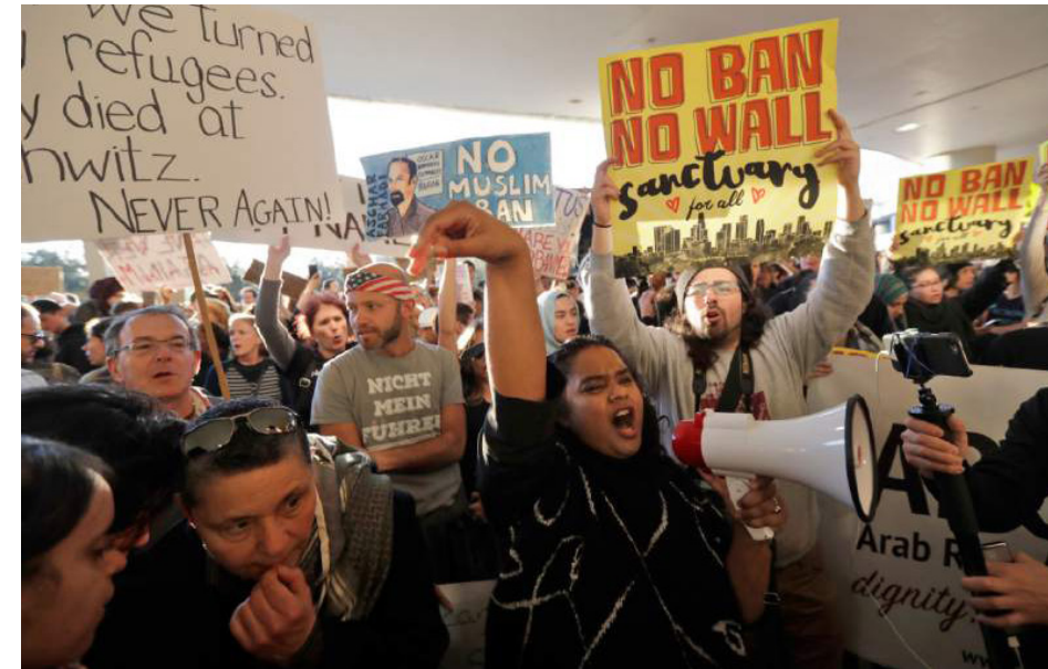
In response to Trump's Muslim ban, protesters occupied airports across the country. The above photo shows the occupation of San Francisco International Airport. (The front page photo shows the occupation of Los Angeles International Airport.)

9 Join BAMN. Contact us to attend our next meeting and/or to form a BAMN chapter in your neighborhood, school, college or university; to form a caucus in your workplace; or to affiliate your club or organization with BAMN.