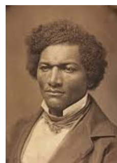
Frederick Douglass: the greatest of the abolitionists. A renowned author, orator, and agitator, Douglass was born a slave, escaped to freedom, and then succeeded in destroying slavery, itself.

Frederick Douglass, speaking to a crowd of abolitionists in New York, said "my hopes were never brighter than now. I have no fear that the National Conscience will be put to sleep by such an open, glaring, and scandalous tissue of lies as that